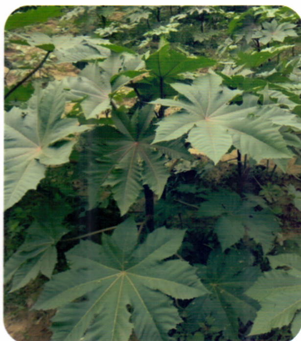
Plate . 5. Castor ( Ricinus communis L.) plant