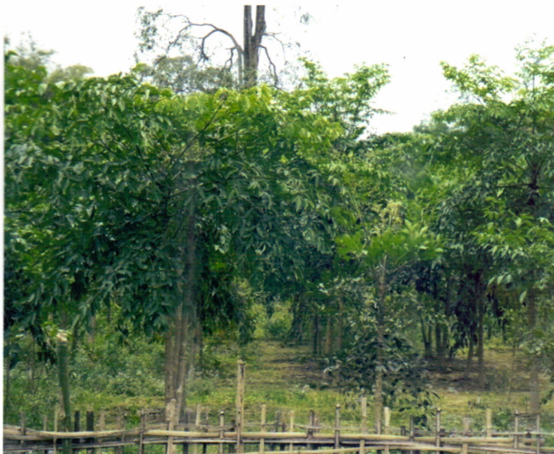
Plate . 4. Kesseru , Heterpanax fragrans (Roxb.) plant